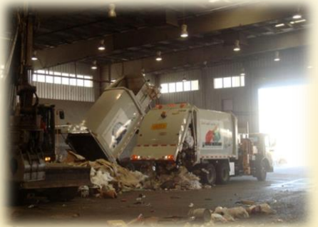
Waste Plant Odor Control

Disinfection: Targeting microbes at the surface, destroying the DNA of contamination at the source.