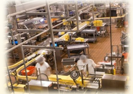
Food processing microbial control